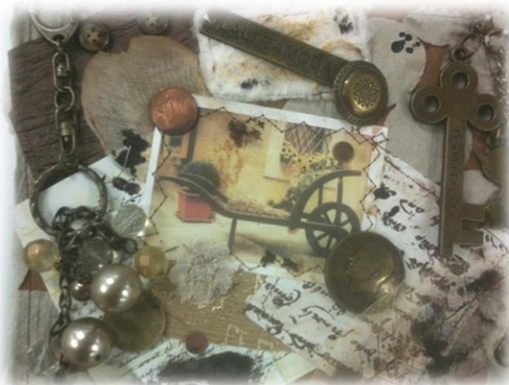
An example of recent Y9 work

Printed and/or Dyed: Students will become aware of a variety of different media, such as commercial fabric paints, fabric painting inks and application methods. For the printed application, students are expected to show a range of techniques for transferring image to fabric, such as block, screen and discharge printing. Dyed application requires the student to be familiar with a range of processes such as batik, silk painting and tie and dye. Students should also become familiar with dipping and spraying.