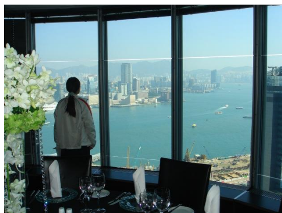
View from HSBC's Asia Headquarters

Assessment: Candidates will take 2 exam papers (each worth 40% of total marks) plus an additional coursework component (worth 20% of total marks)