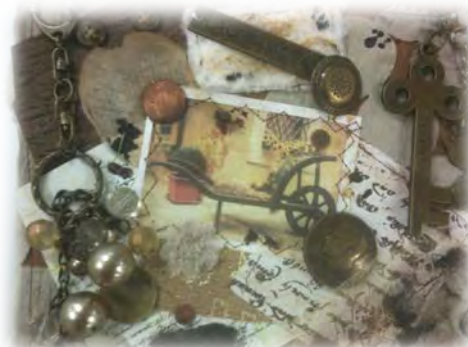
An example of recent Y9 work

Fashion: Students will learn to construct fabrics into fashion outcomes gaining knowledge of fashion and its inclusion within textiles. Students will be encouraged to include techniques from both constructed and printing/dyeing techniques to create outcomes that are both interesting but also push the students in their creative abilities and skill with precision.