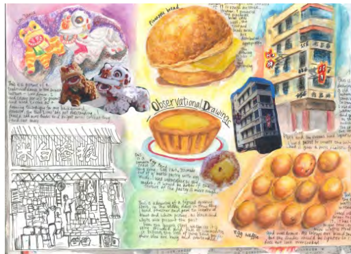
Belle Lai (10E) coursework page, 2012

Students who put in the time make fast progress in their technical skill, so those concerned about their current ability should not worry too much. More important is a strong work ethic and a commitment to spend at least 2 hours per week on their artwork outside of class.