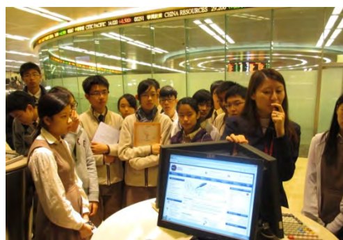
Students learn about trading while visiting HK Exchanges and Clearing