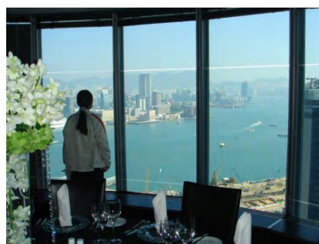
View from HSBC's Asia Headquarters

Assessment: Candidates will take 2 exam papers (each worth 50% of total marks).