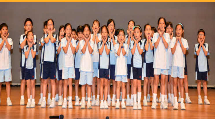
Winner : 4C