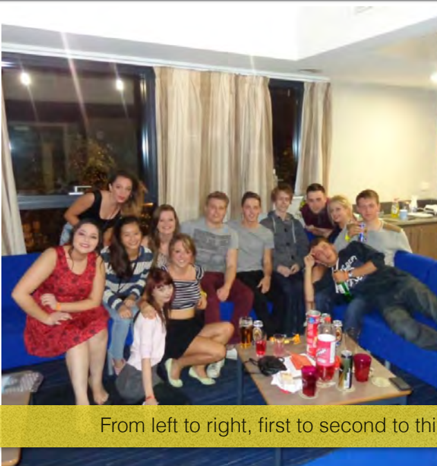
From left to right, first to second to third year in our respective flats and houses.

I studied English and Communications and Media Studies at the University of Liverpool, in other words, half of my course focuses on English Literature and the other half does bits of everything (from film to law to business).