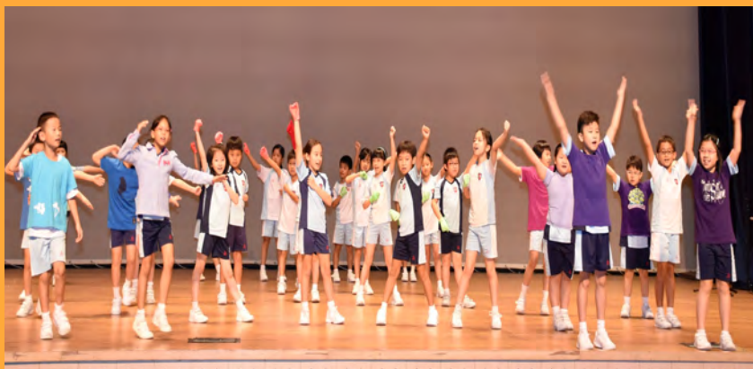
Winner : 3F