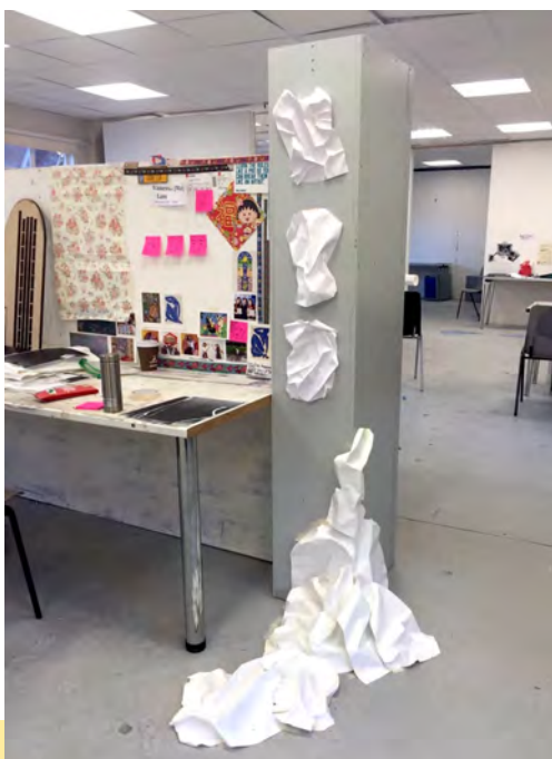
Vanessa's studio place at Goldsmiths

Not to mention it does make you a stronger applicant when it comes to university/ scholarship application!