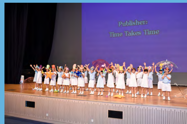
Winner : 1A

The winning classes are 1A, 2F, 3F, 4C and 5B. Congratulations!