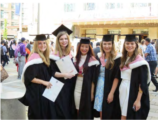
Here's a photo of me and a few of my friends who do English and Communications with me.