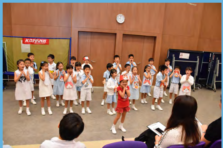
Winner : 2F